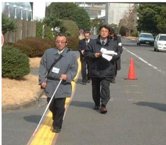
Fig1. The guidance system for a blind person

Secondly, the navigation device is an embedded system that is equipped with a microprocessor unit (MCU), an RFID reader, a communication module, a user interface module, a memory module. The MCU is ARM7TDMI-S based high-performance 32-bit RISC Microcontroller with Thumb extensions 512KB on-chip Flash ROM with In-System Programming (ISP) and In-Application Programming (IAP), 32KB RAM, Two UARTs, one with full modem interface. The communication module communicates with the navigation data to send a request and to receive a planned route from the server for navigation. We use the Bluetooth module to convey information via wireless networks.