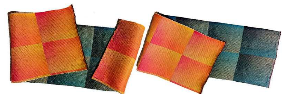
Figure 3: Experiment of two colour double-cloth