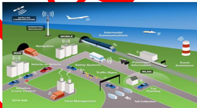
Figure 3: A sketch of automated communication

The equivalents of these driver muscle functions are electromechanical actuators installed in the automated vehicle. They receive electronic commands from the onboard control computer and then apply the appropriate steering angle, throttle angle, and brake pressure by means of small electric motors. A sketch of automated communication is given in figure 3. Early versions of these actuators are already being introduced into production vehicles, where they receive their commands directly from the driver's inputs to the steering wheel and pedals. These decisions are being made for reasons largely unrelated to automation. Rather they are associated with reduced energy consumption, simplification of vehicle design, enhanced ease of vehicle assembly, improved ability to adjust performance to match driver preferences, and cost savings compared to traditional direct mechanical control devices [16-24].