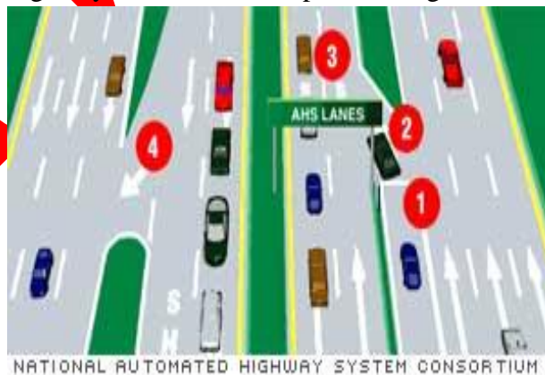
Figure 2: National automated highway consortium

Other researchers have used computer vision system to observe the road. These are vulnerable to weather problems and provide less accurate measurements, but they do not require special roadway installations, other than well-maintained lane markings. Both automated highway lanes and intelligent vehicles will require special sensors, controllers and communications devices to coordinate traffic flow. A national automated highway consortium is depicted in figure 2.